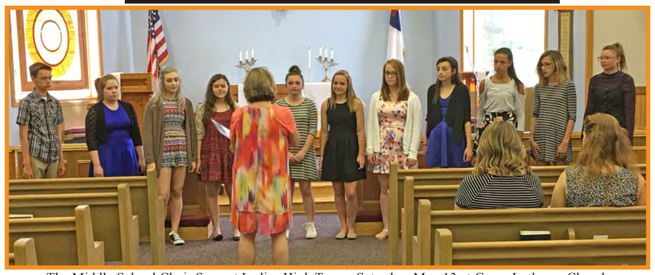
The Middle School Choir Sang at Ladies High Tea on Saturday, May 13 at Grace Lutheran Church.